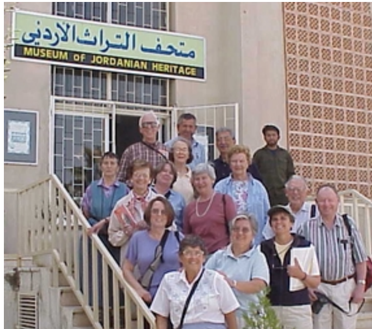
Lessons to be learned for the Museum of Chebeague History