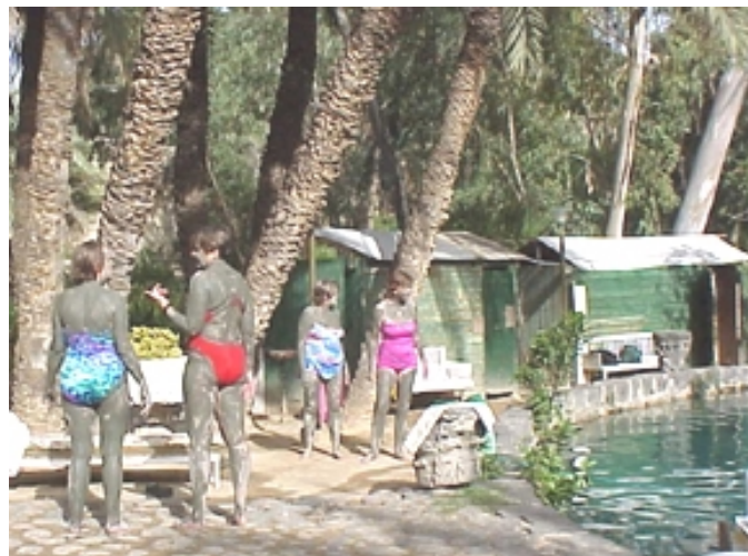
Taking a mud bath at the Bisharat farm