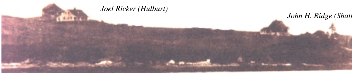
Before there was a Cottage Road; Cottage Road Neighborhood pre-1900

People often wonder why the North Road changes names in what appears to be midstream and becomes the Cottage Road. They also wonder where the North Road ends and the Cottage Road begins. To answer these seemingly simple questions requires an understanding of the development of Great Chebeague Island. This article is the beginning of a series of several articles that will be published in the Sloop's Log over the next year or so which will take the reader through a journey that will discuss many of the island's historical periods and themes. This discussion will focus on the neighborhood from the Ballard Farmhouse on the North Road to the South Road.