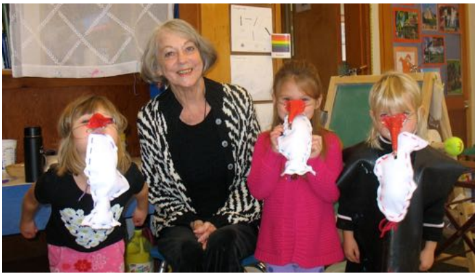
Here they all are with their beaks and fish. Below they are in their common tern costumes. Come to the holiday concert to see them in action!