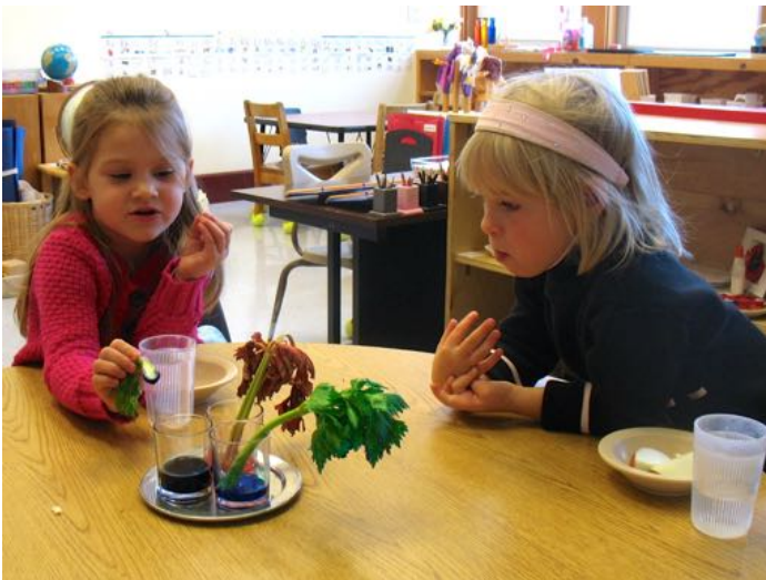
Observing the results of putting celery stalks into colored water. They now know that stems slurp up the water and deliver it to the leaves.