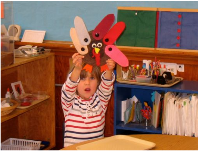
Buttoning on the turkey feathers was very popular. They had fun learning about the waddle and snood.