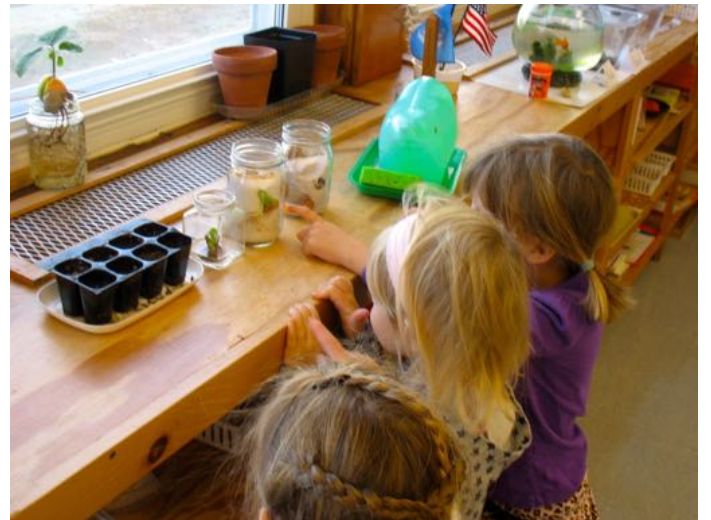
They were very excited to notice the first leaves emerging from the bean seeds. We have since planted them in dirt and the botanist waters them as part of their morning job.