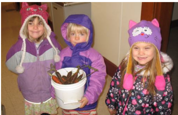
On a cold morning we harvested the last of the carrots. Below they are pulling back the husks on the popcorn that survived the raccoons.