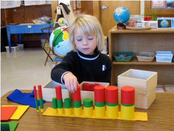
Visual discrimination, fine motor skills and concentration with the round cylinders