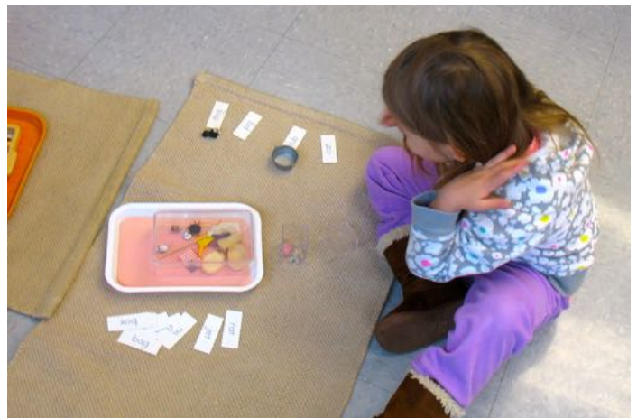
Matching phonetic words to their object. At this stage they choose 4 or 5 objects, I pull those words and then they work on the decoding.