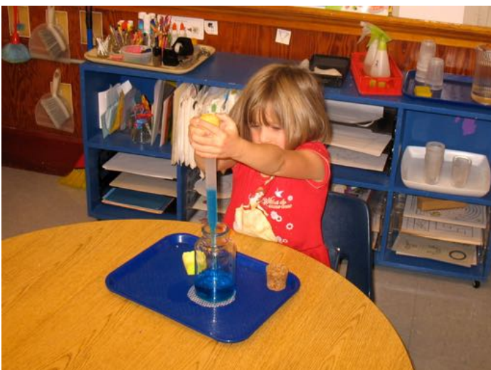
Fine motor squeezing practice and concentration with the turkey baster