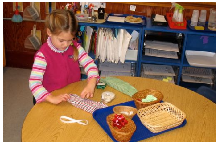
As we approach the holiday season we are practicing gift-wrapping, and appropriate etiquette for giving and receiving a gift.