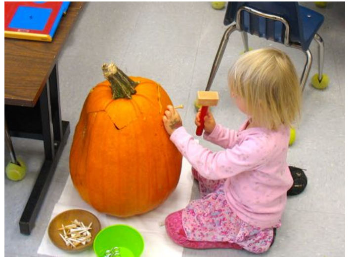
Fine motor practice hammering golf tees into a pumpkin. Later eyelet bolts were added as an option with string to lace and then Phillips screws and screwdriver.