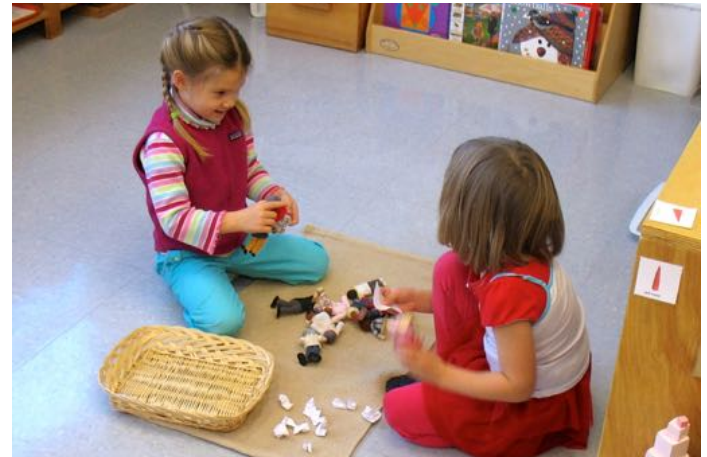
Reenacting some of the story about Harriet Tubman and Follow the Drinking Gourd. They added crumpled bits of paper to be cotton and hid people under the basket. On a clear night look for the big dipper (drinking gourd) and talk about how the slaves used the stars and songs they had learned to help them find their way north.