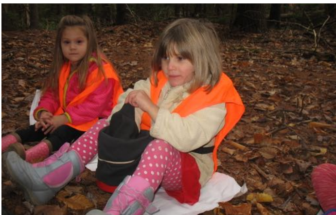
When in the nature classroom the "feely bag" has them using their sense of touch.