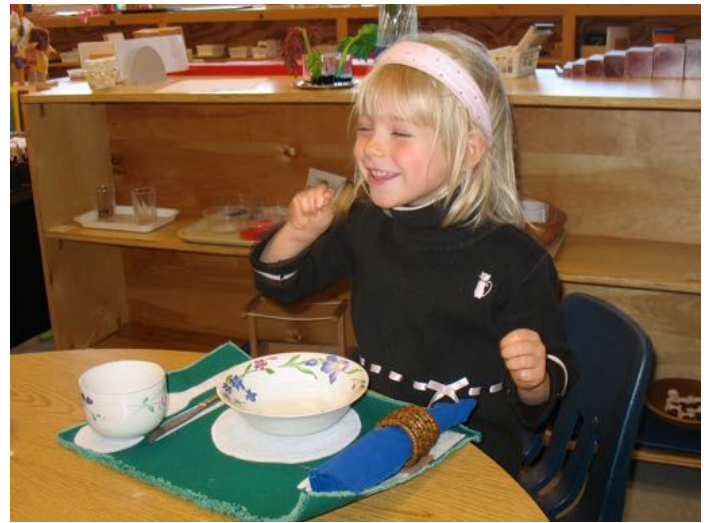
Practicing setting the table. Wondering if they share their skills at home...