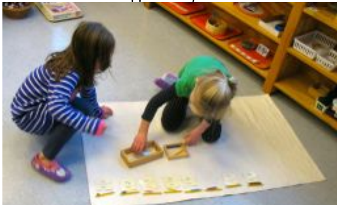
They are all beginning to make teen numbers with a ten bar and bead stairs.