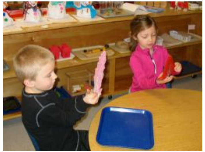
Fans are fun to explore.