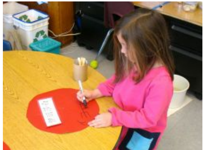
Each child made an emperor/empress hat. We started by cutting out a 2-D circle with a slit. They wrote their name in Chinese characters.