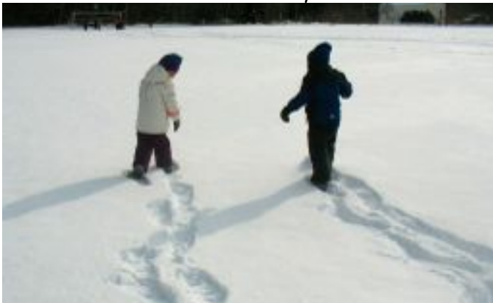
The snow has provided us two opportunities to try out snowshoes. Some associated it with walking with flippers on your feet.