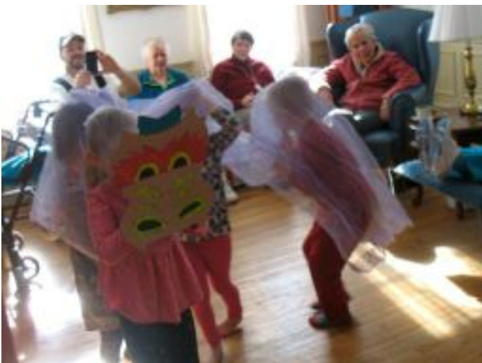
They shared the Chinese New Year dragon dance with our friends at the Island Commons.