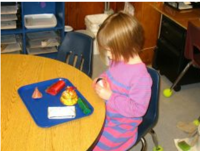
A fine motor work: Hide the Buddha in one of the Chinese purses. Have a friend find the Buddha. They all have different closures.