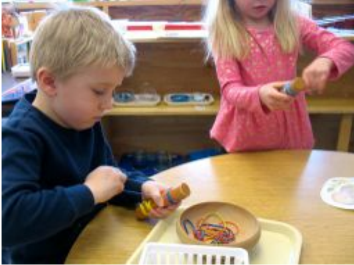
A popular fine motor work has been wrapping elastics around a cylinder.

This newsletter will take you through February 7 th . My camera with more recent photos still resides at school because of the snow day.