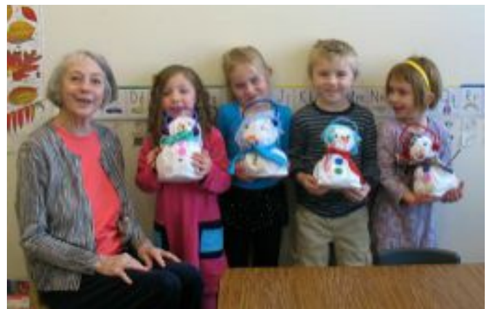
We talked about the difference between 2-D and 3-D shapes. We drew a 2-D snowman on paper, made a 3-D snowman by stuffing newspaper into a plastic bag, shaped it with string and tape before putting it in a white bakery bag and decorating it. They then drew a 2-D portrait of their creation.